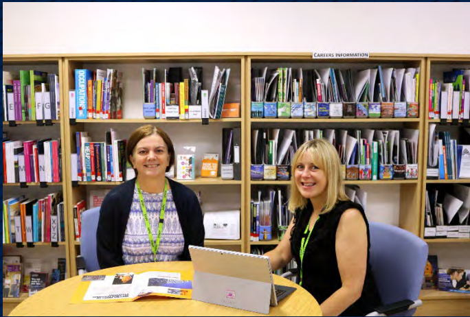
Careers and Employability